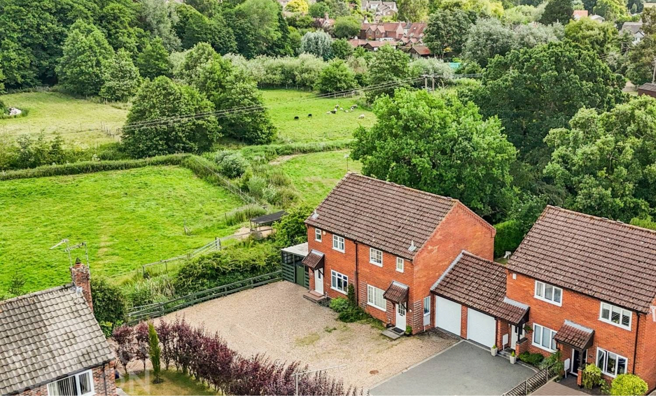
Beck Way, Loddon - NR14 6UZ