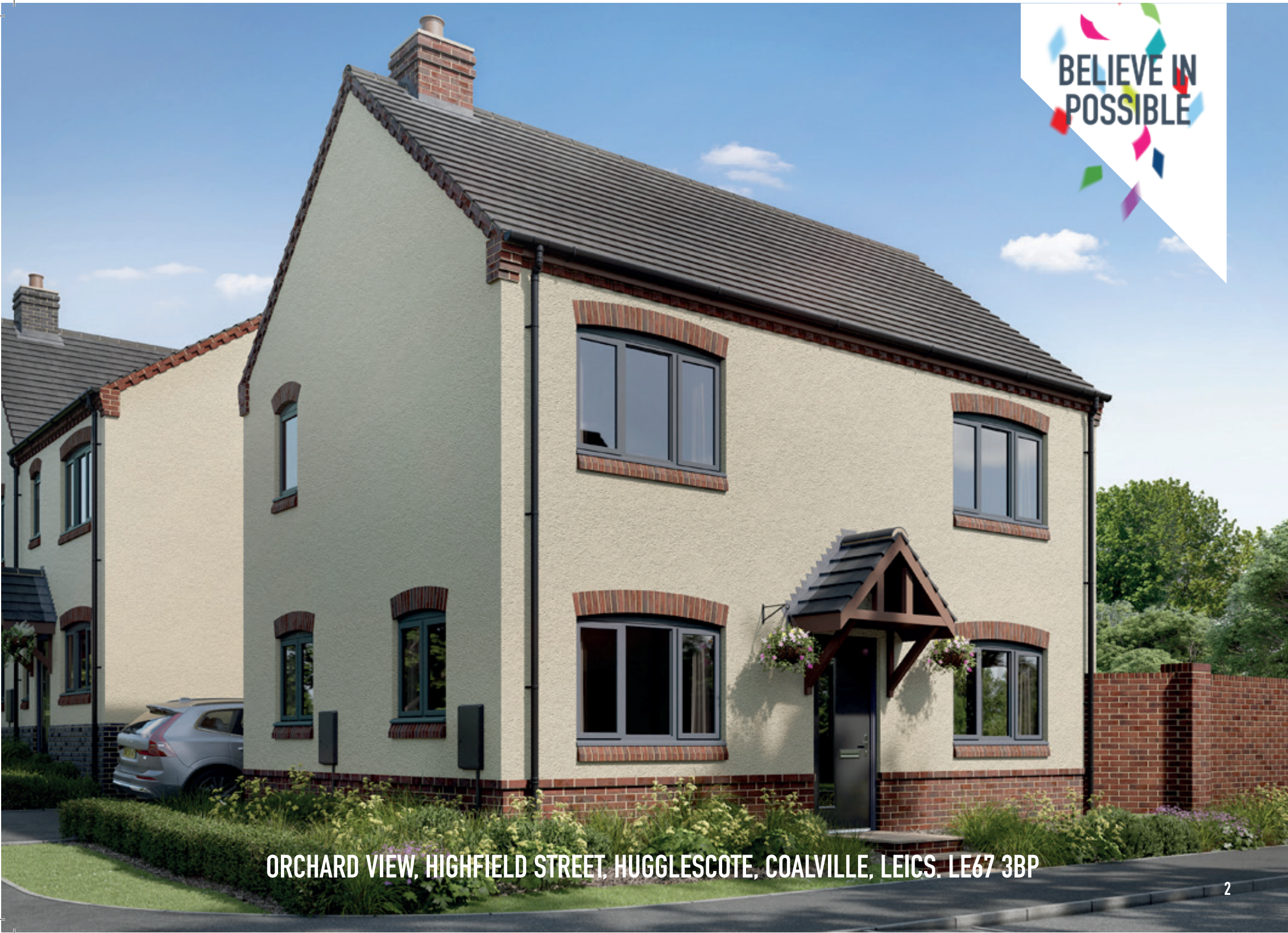
ORCHARD VIEW, HIGHFIELD STREET, HUGGLESCOTE, COALVILLE, LEICS. LE67 3BP