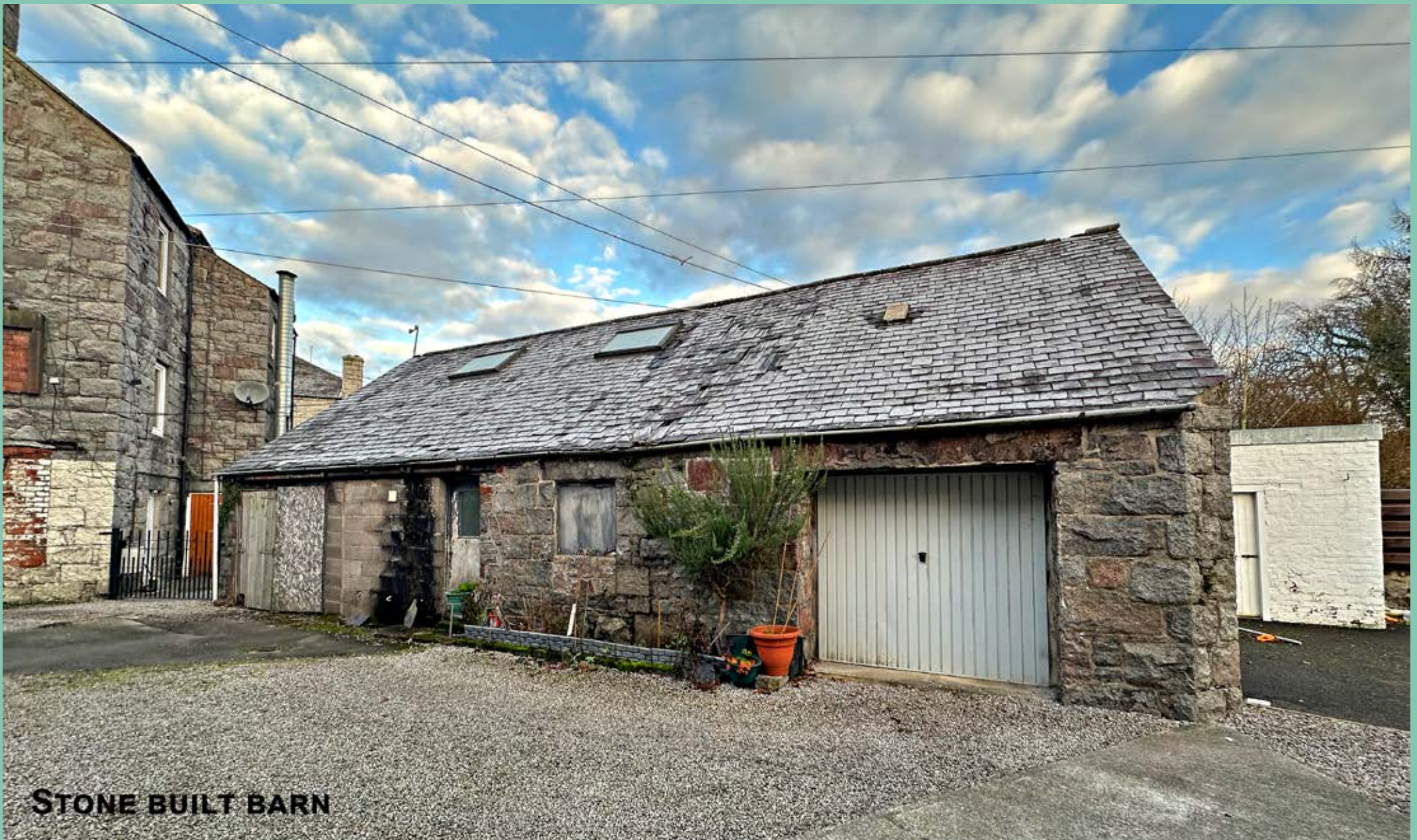
STONE BUILT BARN