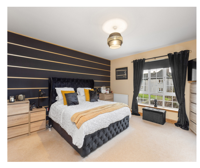
5 Bed | 3 Bath | 231m2