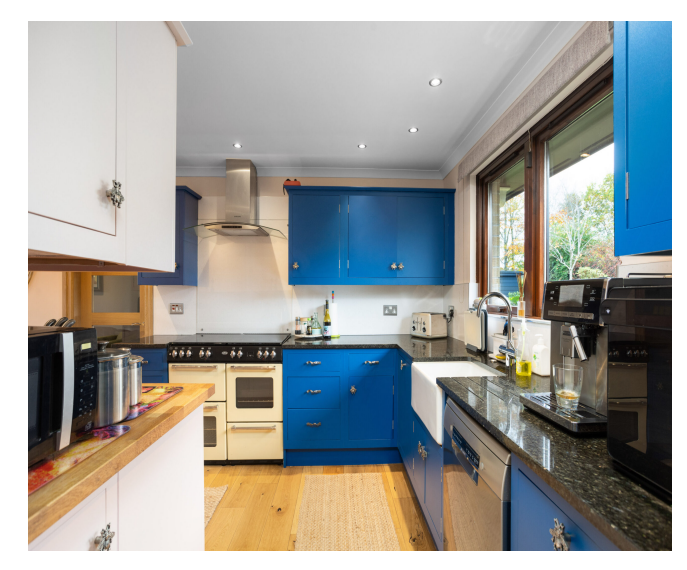
5 Beds | 5 Baths | 296m2