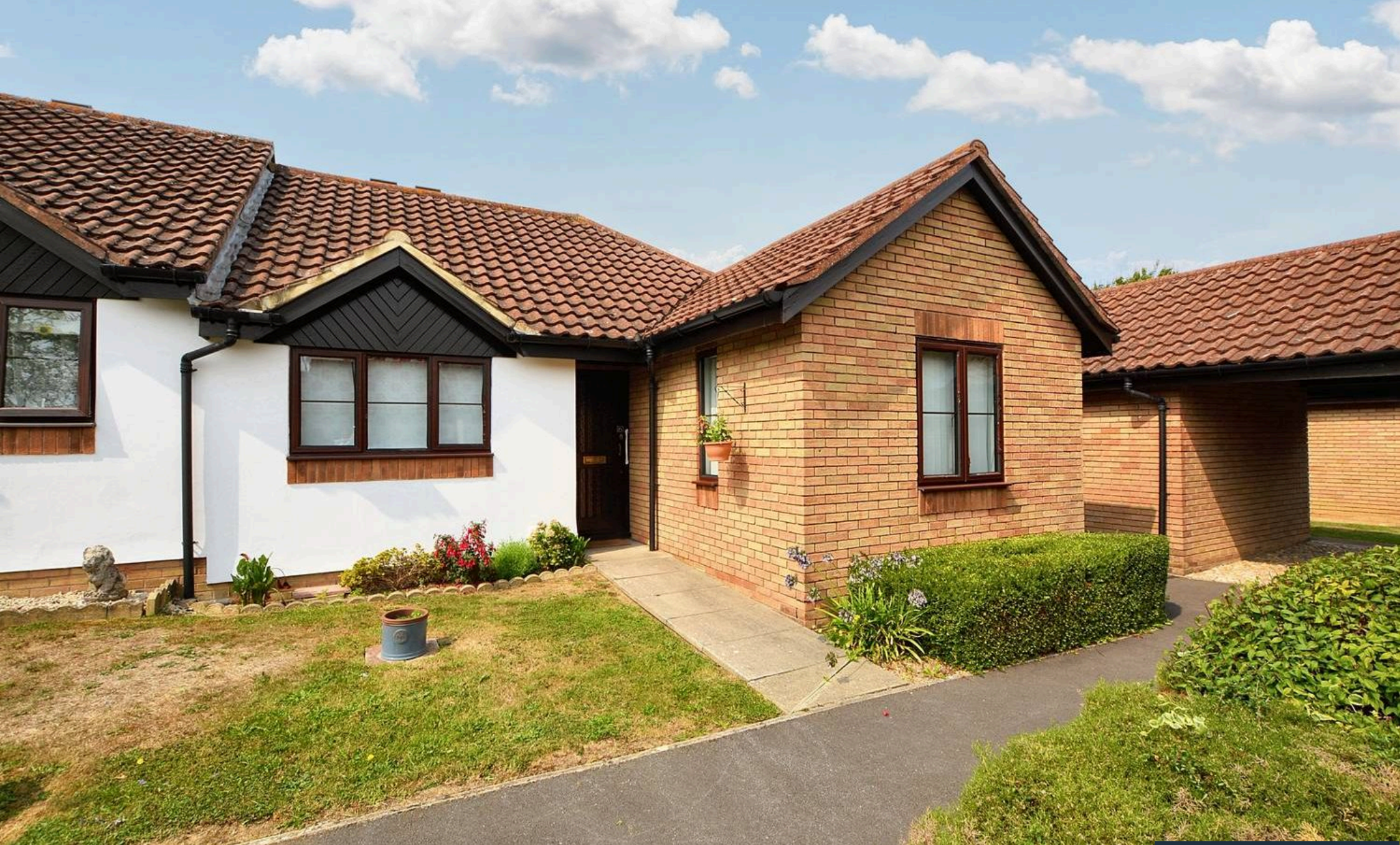
6 Meridian Court, Ashford £220,000