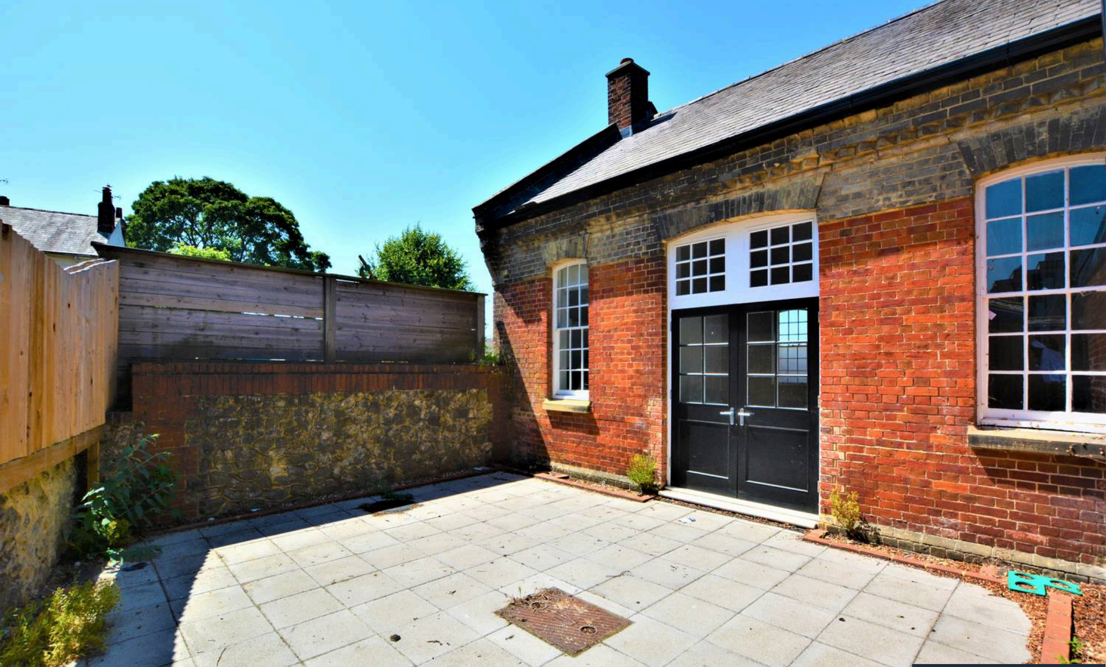
1 Apsley House Chart Road, Ashford £290,000