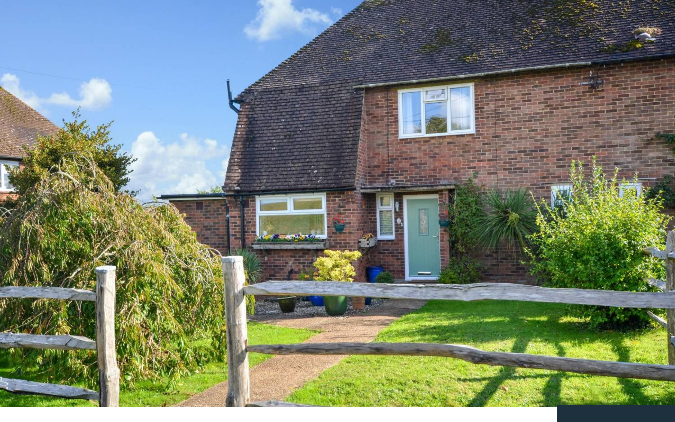
4 Cosway Cottage Bonnington Road, Bilsington In Excess of £350,000