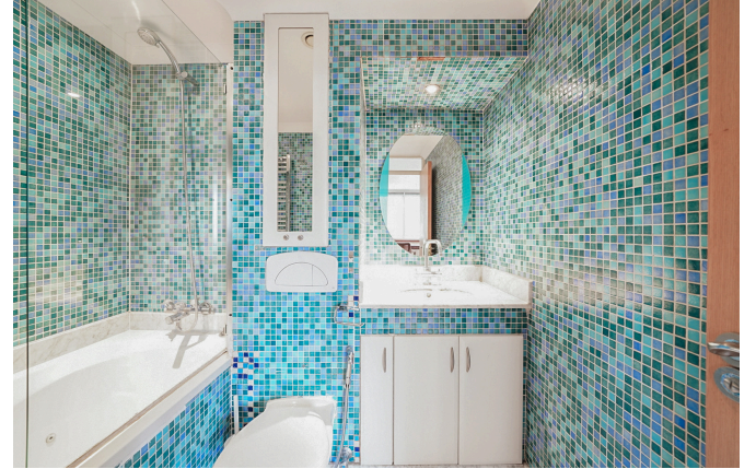
THE QUADRANGLE W2