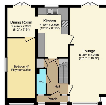
Ground Floor Floor area 67.7 sq.m. (729 sq.ft.)