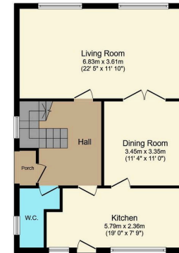
Ground Floor Floor area 66.8 m 2 (719 sq.ft.)