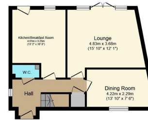
Ground Floor Floor area 47.9 sq.m. (516 sq.ft.)