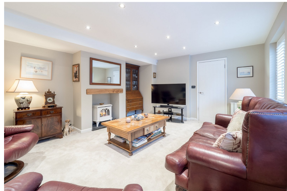
The Dormer House, Alveston Approximate Gross Internal Area = 178.0 sq m / 1916 sq ft