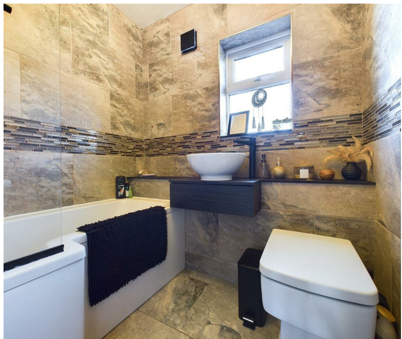
Watermint Way, Calne