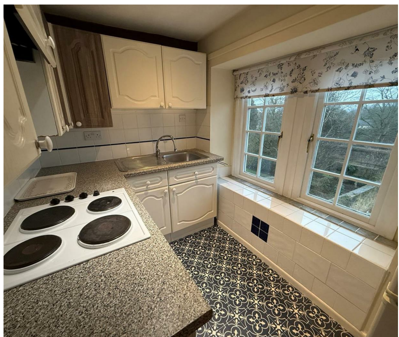
The Green, Calne