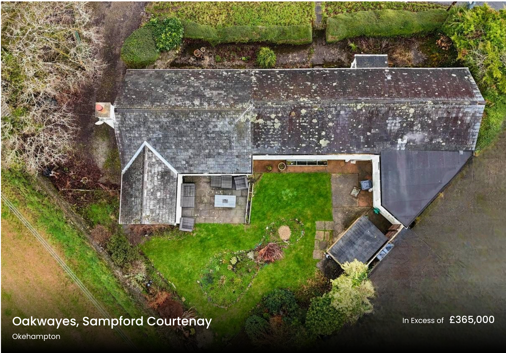
Oakwayes, Sampford Courtenay Okehampton