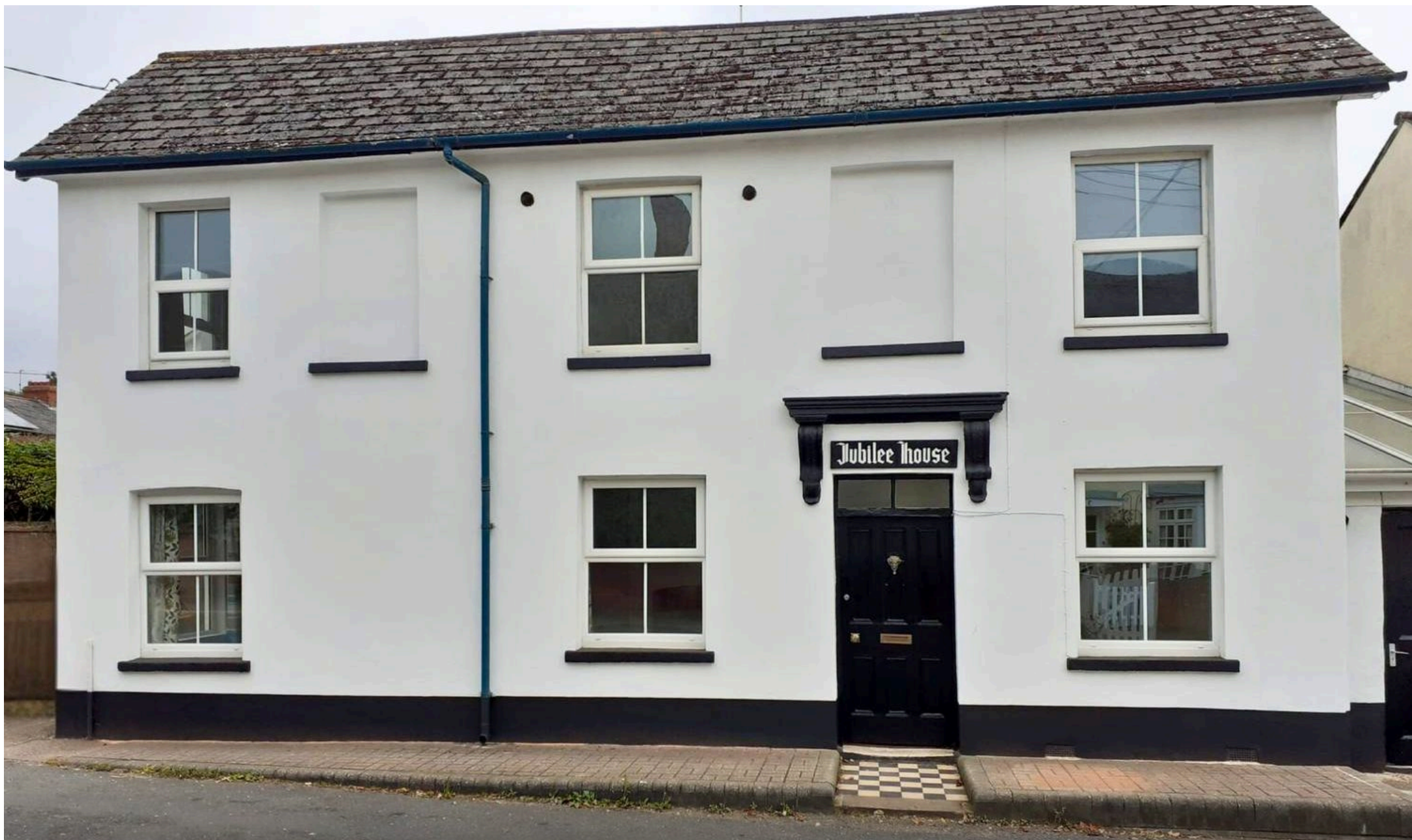
Jubilee House, Woodbury