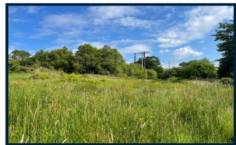
The Park, 17 Camuscross, Isle Ornsay, Isle of Skye. Scotland. IV43 8QS