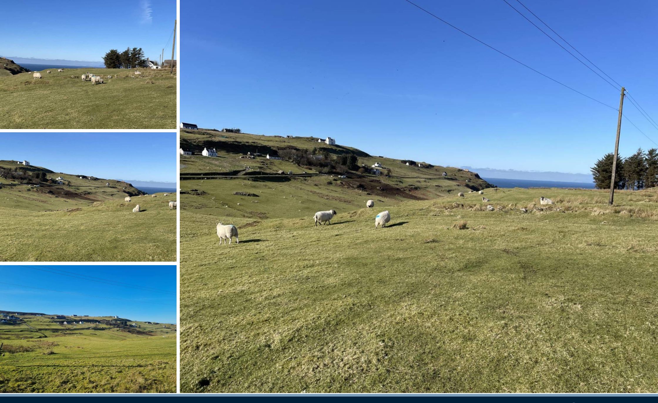
Plot A at 15 Upper Milovaig, Glendale, Isle of Skye, IV55 8WY Offers Over £75,000