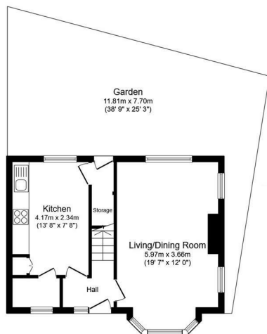
Ground Floor Floor area 40.4 sq.m. (435 sq.ft.)