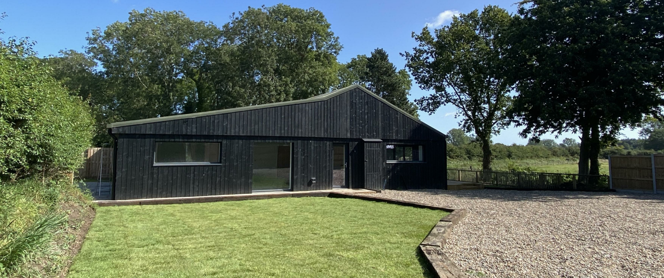
Wymers Barn Hall Road, Mautby, Great Yarmouth NR29 3JB £550,000