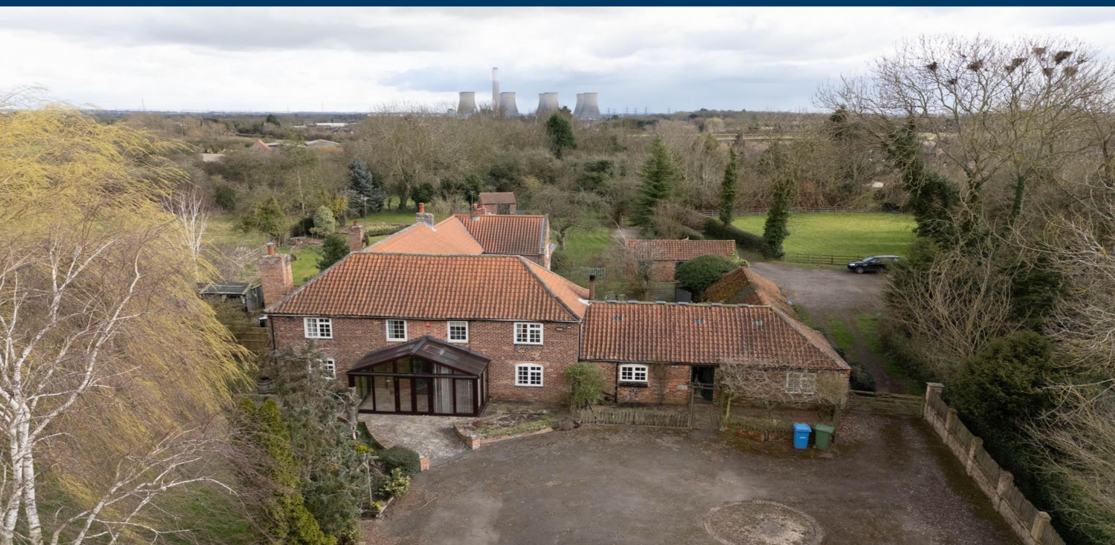
The Old Barn, Town Street, Treswell, DN22 0EW