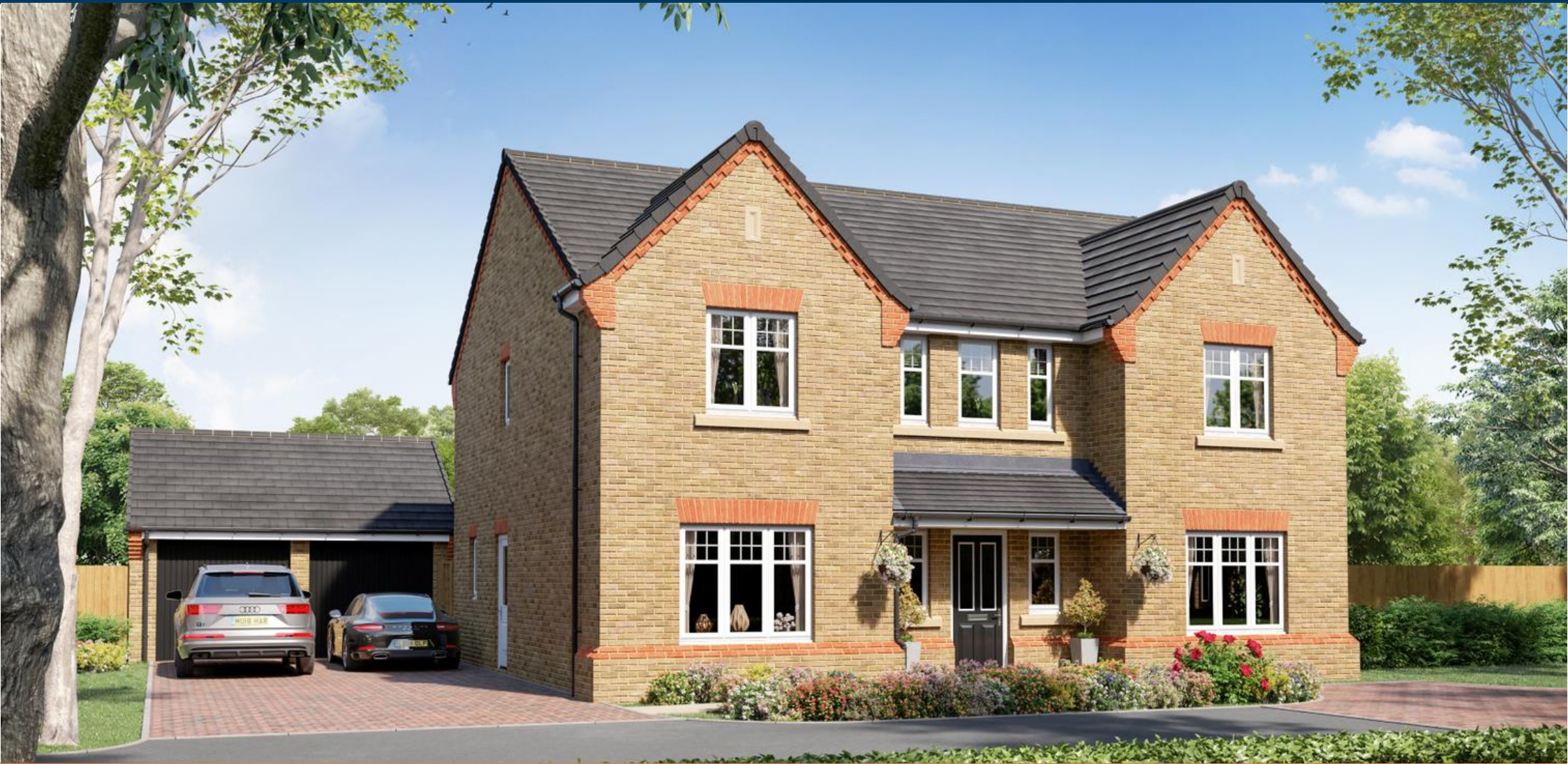
The Edlingham at The Brambles, London Road, Retford, DN22 7JE