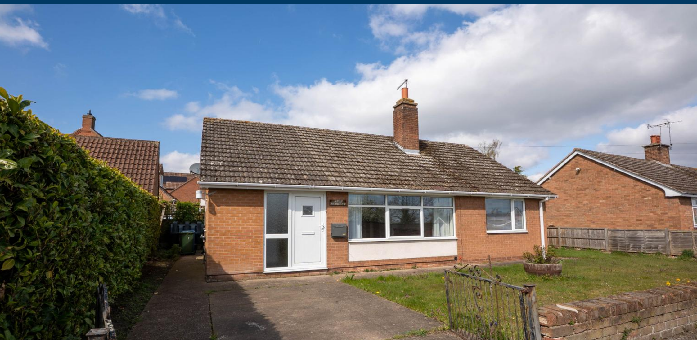
Pine Cottage, Everton, DN10 5AR