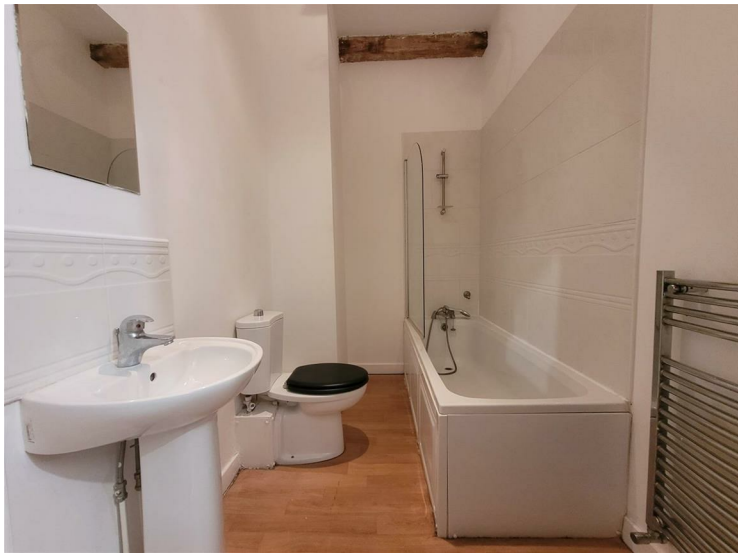
3 piece white suite comprising: low level wc, pedestal wash hand basin, panelled bath with shower over, tiled shower area, mirror with light above basin, chrome heated towel rail, laminate to floor and creme walls.