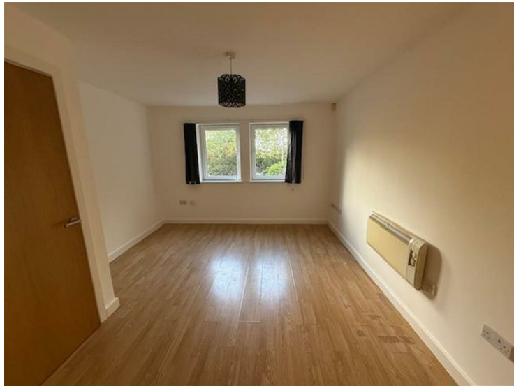
OPEN PLAN LOUNGE/KITCHEN