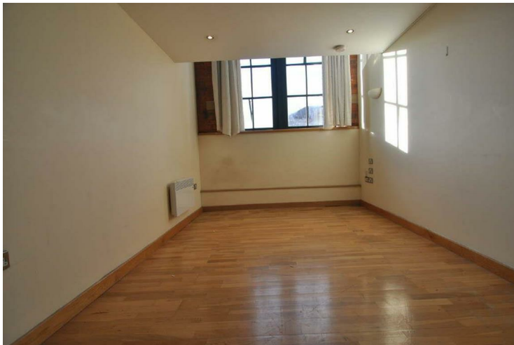
Open plan lounge/kitchen with all intergrated appliances, wood flooring and wall heater.