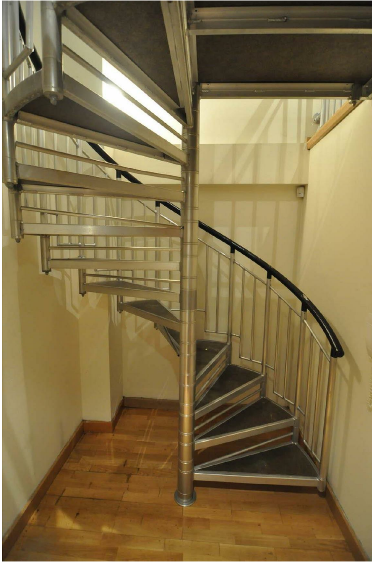
Mezzanine Staircase and S/W Flooring; Alarm unit.