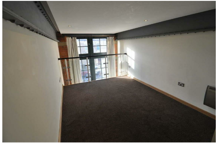
Master bedroom with modern decor and carpet and en-suite shower room.