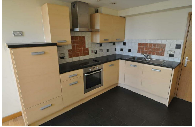
Beech Shaker units with integrated appliances. Granite effect worktop, tiled splashback surround.