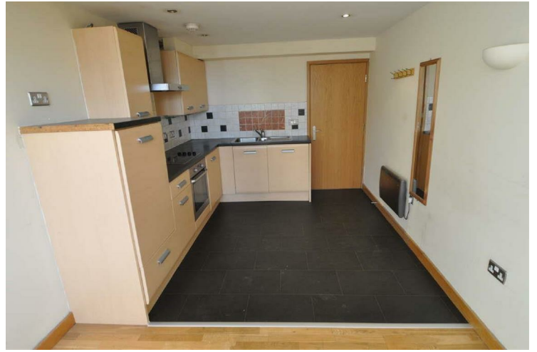
Indesit Schott Ceran Hob, integrated AEG Oven.