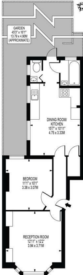
GROUND FLOOR FOR ILLUSTRATION PURPOSES ONLY

THIS FLOOR PLAN SHOULD BE USED AS A GENERAL OUTLINE FOR GUIDANCE ONLY AND DOES NOT CONSTITUTE IN WHOLE OR IN PART AN OFFER OR CONTRACT. ANY INTENDING PURCHASER OR LESSEE SHOULD SATISFY THEMSELVES BY INSPECTION, SEARCHES, ENQUIRIES AND FULL SURVEY AS TO THE CORRECTNESS OF EACH STATEMENT. ANY AREAS, MEASUREMENTS OR DISTANCES QUOTED ARE APPROXIMATE AND SHOULD NOT BE USED TO VALUE A PROPERTY OR BE THE BASIS OF ANY SALE OR LET.