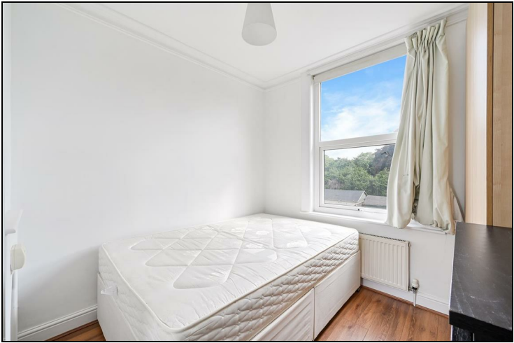
Reception Reception Bedroom Bedroom Bedroom Bedroom Kitchen