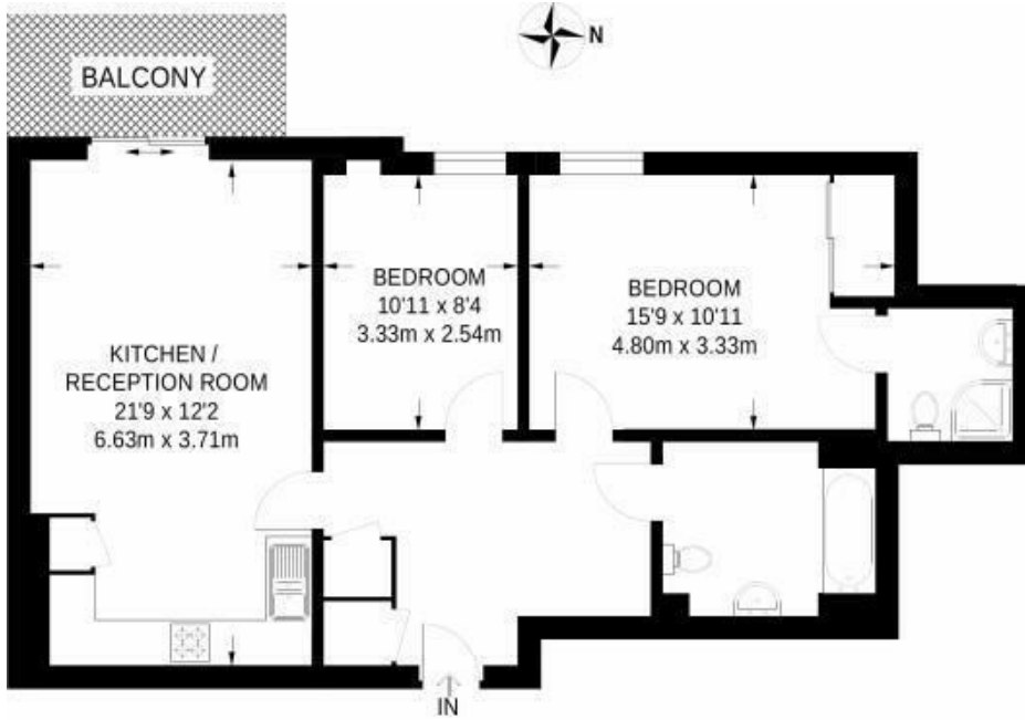
FOURTH FLOOR 786 SQ FT / 73.0 SQ M