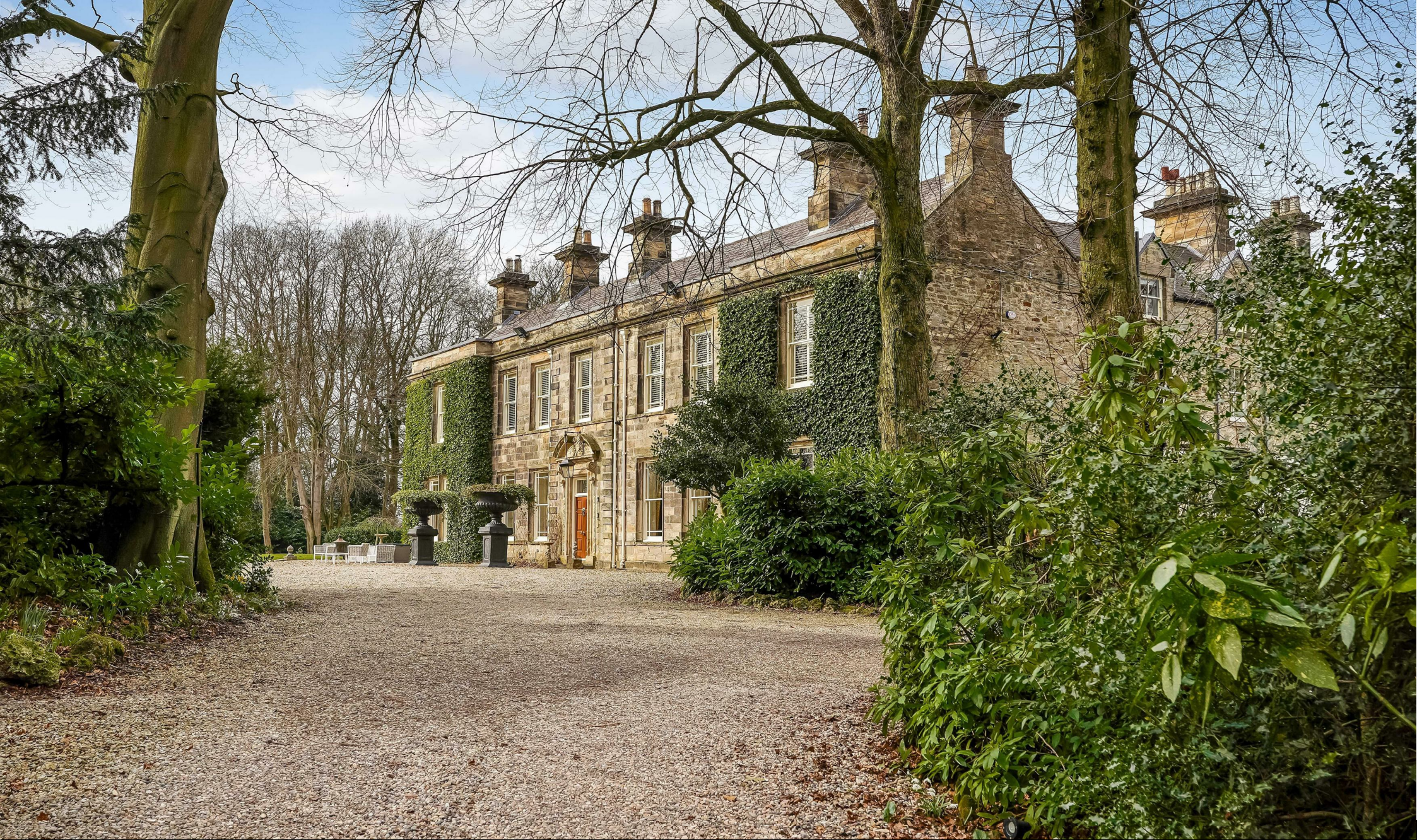
Morton House Chilton Moor | Durham | DH4 6QA