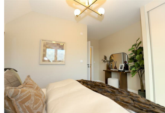
Dressing Room 8'6" x 4'3" (2.6 x 1.3)