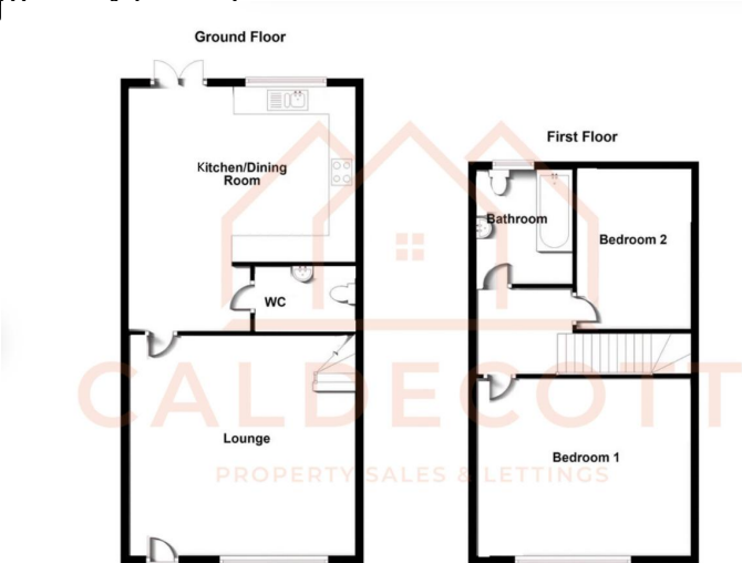
For illustrative purposes only. Measurements are approximate and floorplan should be used as a guide.