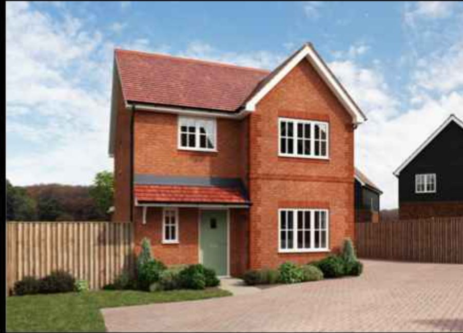
The Fennel 3 bedroom detached home