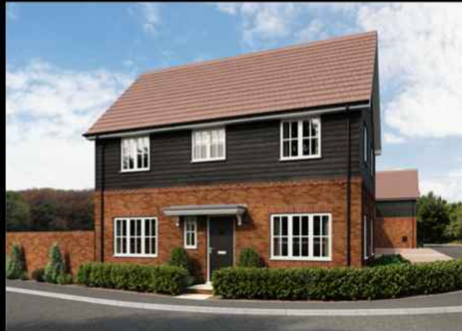
The Chestnut 3 bedroom detached home

Click here for current availability and prices