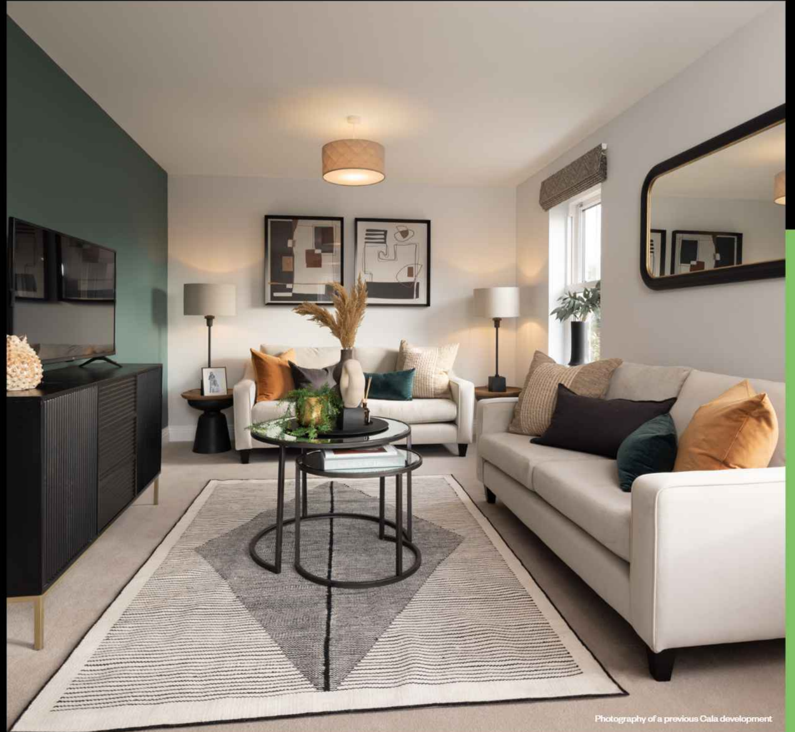
Photography of a previous Cala development

At Ryder Gardens, you'll find a range of beautifully-designed homes, full of light and space, with flexible floorplans to suit you and your lifestyle. The stylish fittings and quality specifications, with an emphasis on sustainability, are complemented by attractive exteriors, with thoughtful, nature-friendly features.