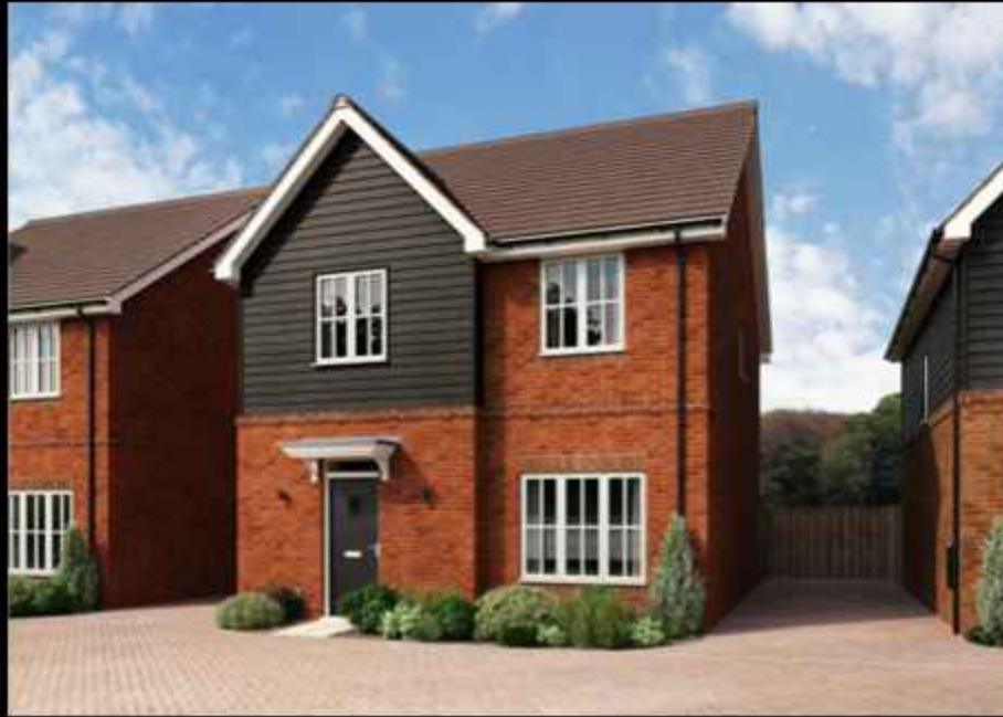
The Laurel 4 bedroom detached home