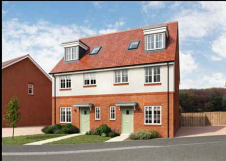
The Elder 3 bedroom semi- detached home