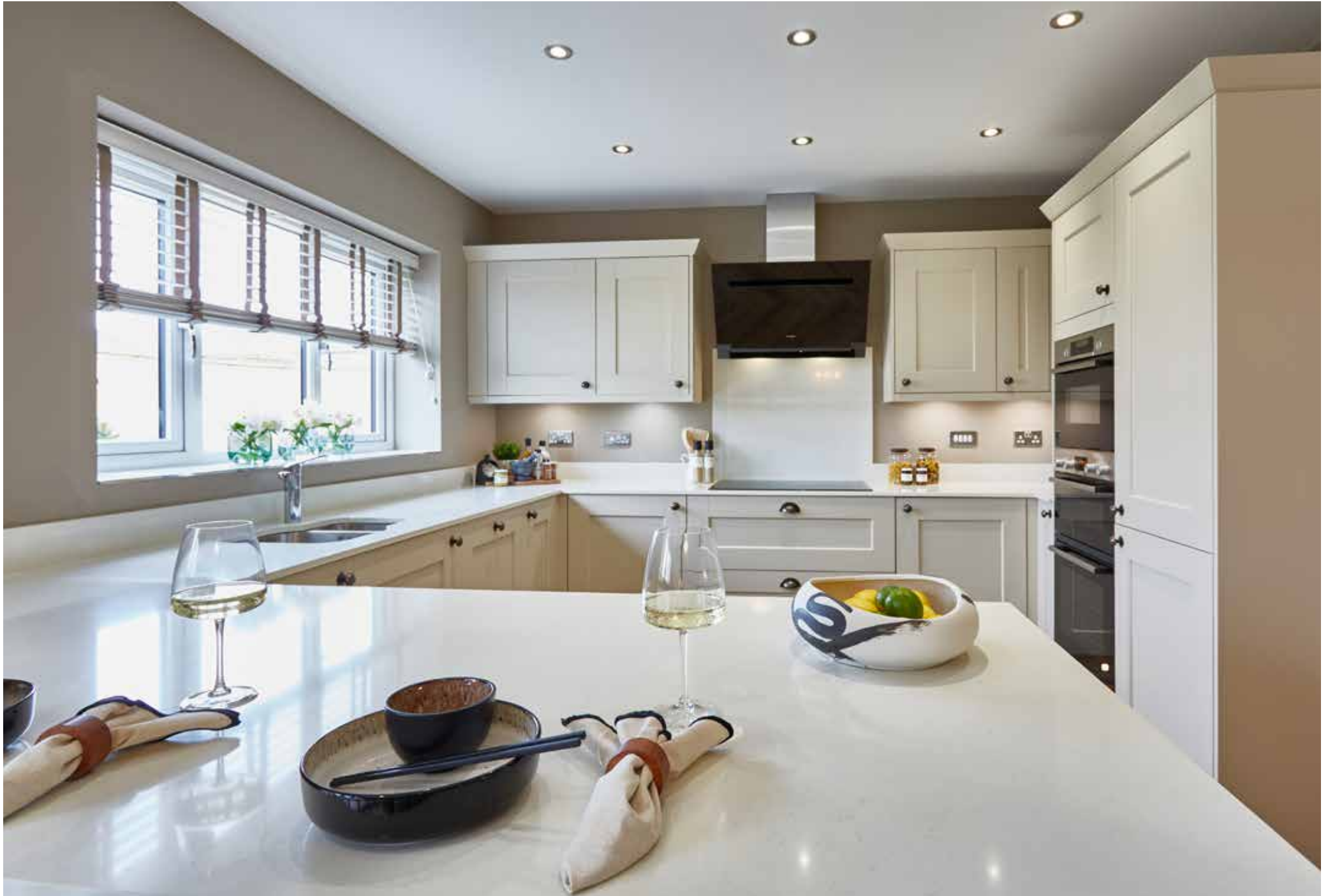
Kitchen featured is Ashbourne in painted stone colour way with Ariel Silestone in a Turnberry kitchen

Please note some images show optional upgrades