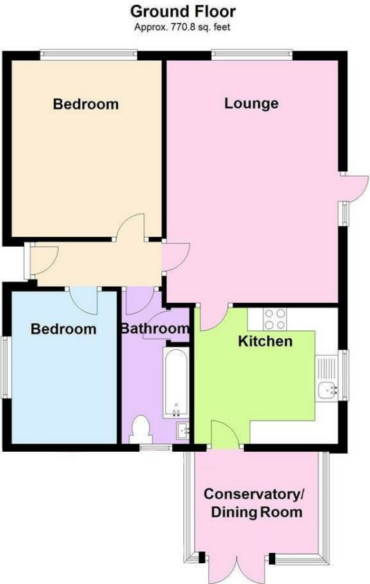
Total area: approx. 770.8 sq. feet