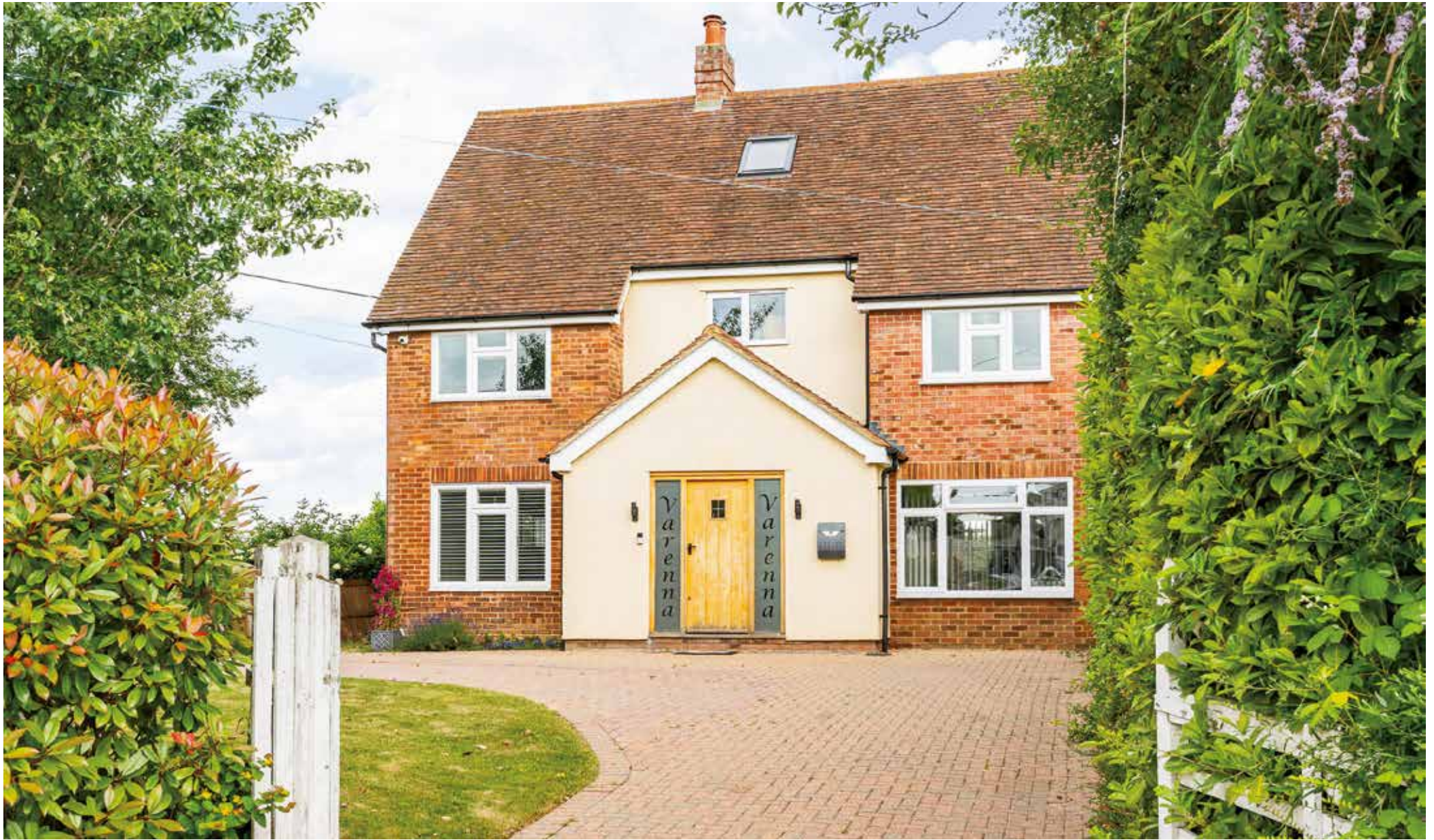
Varenn Tye Green | Good Easter | Chelmsford | Essex | CM1 4SH