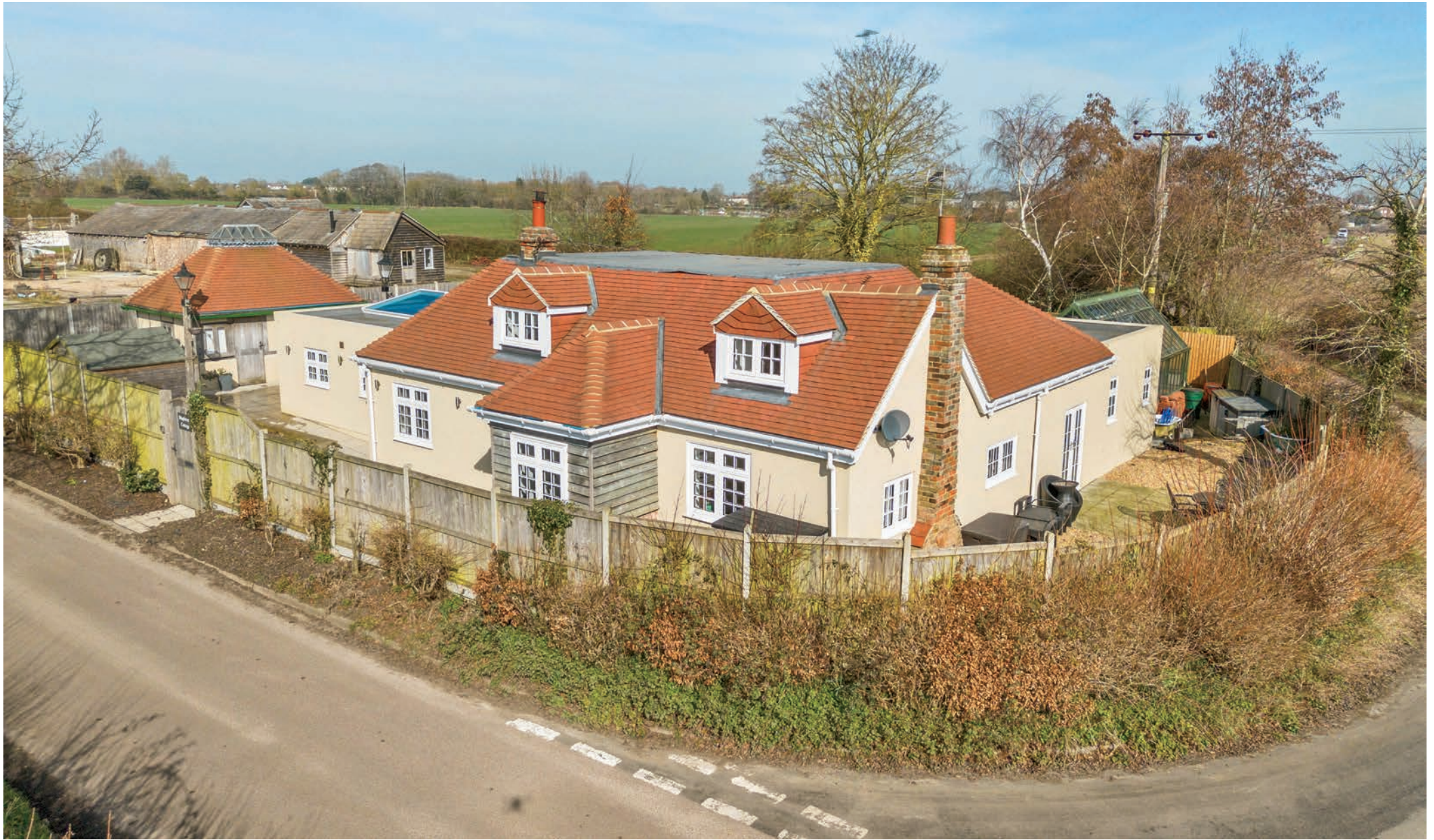
Mapletree Cottage Brook Lane | Great Baddow | Chelmsford | Essex | CM2 7SX