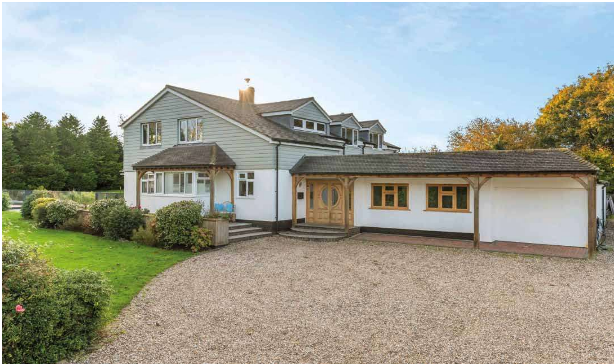
Ladystiles Back Lane | Pleshey | Chelmsford | Essex | CM3 1HL