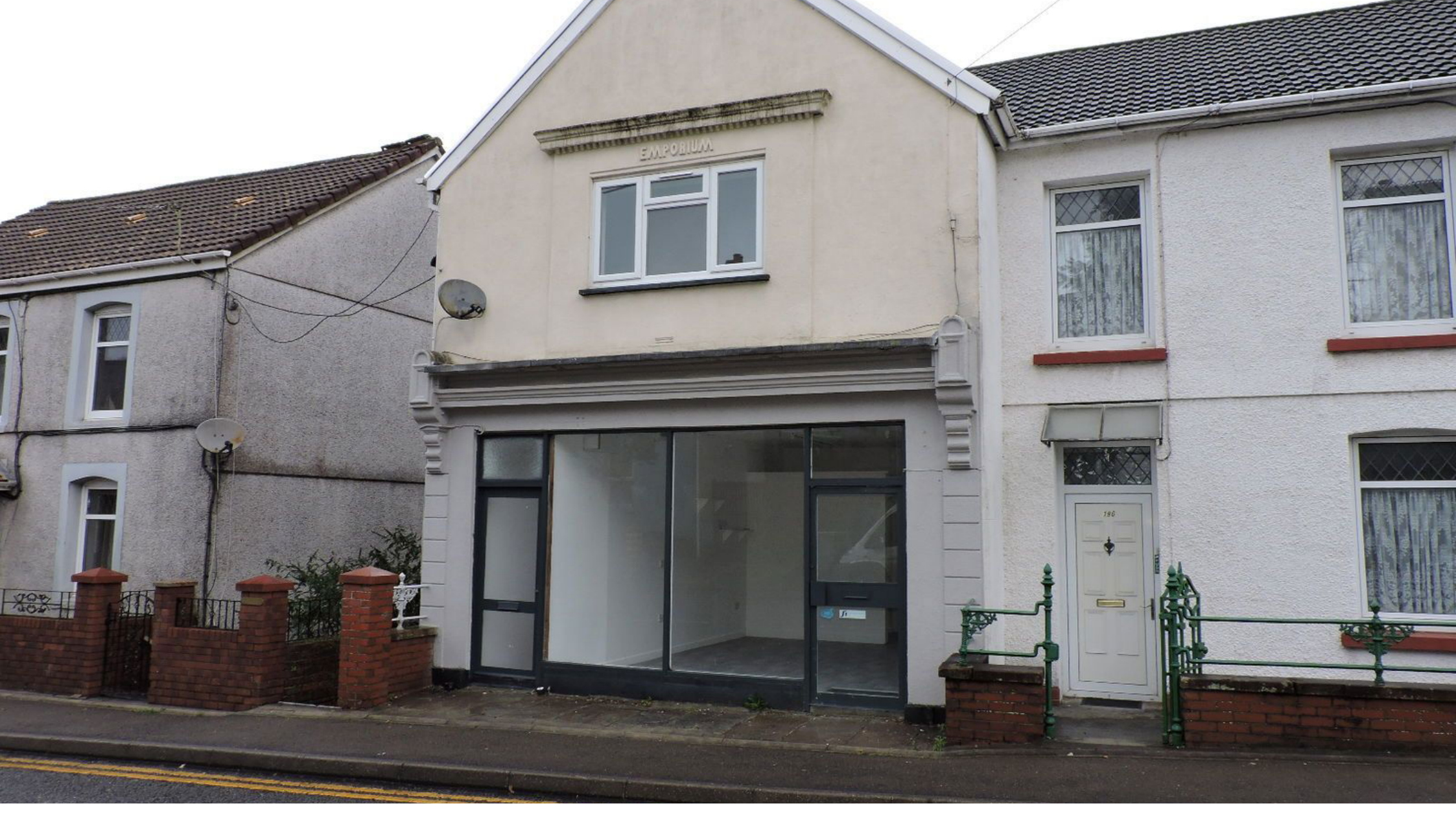
Shop 196, 196A & 196B, Cwmamman Road, Garnant