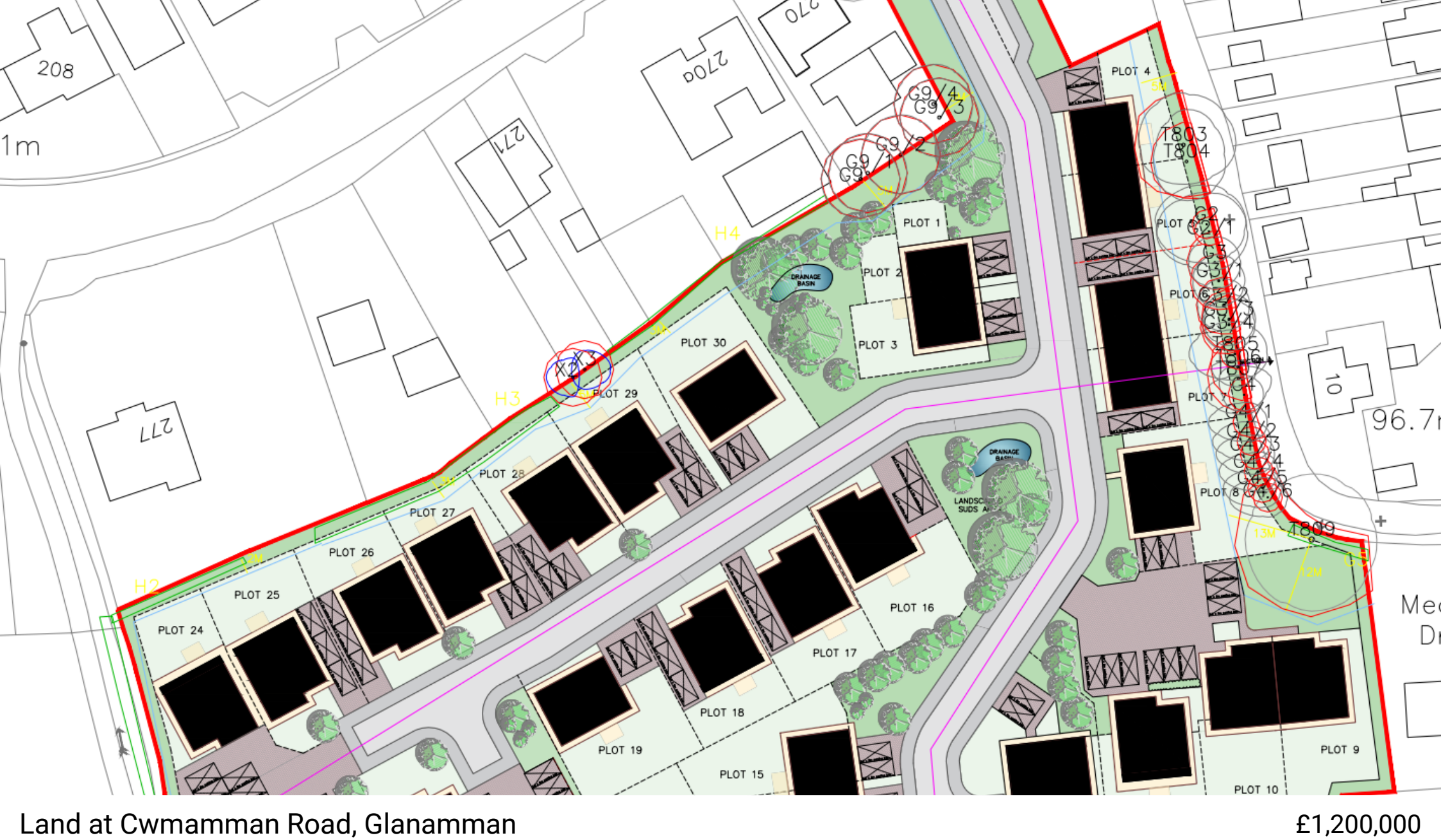
Land at Cwmamman Road, Glanamman