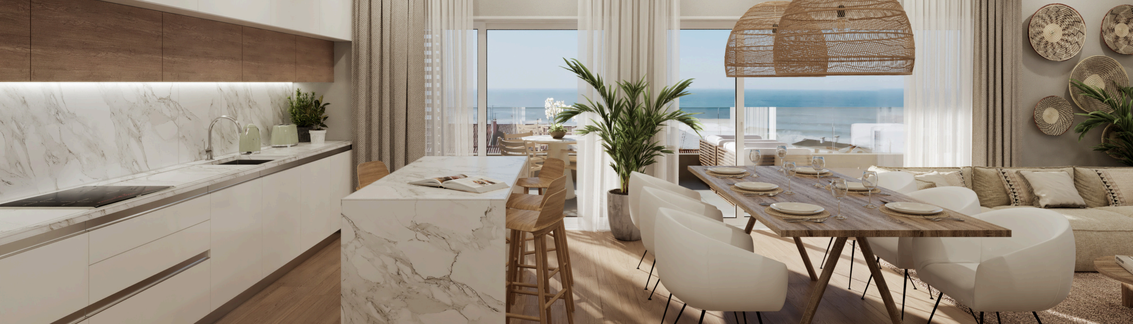
Luxurious spaces with a sea view