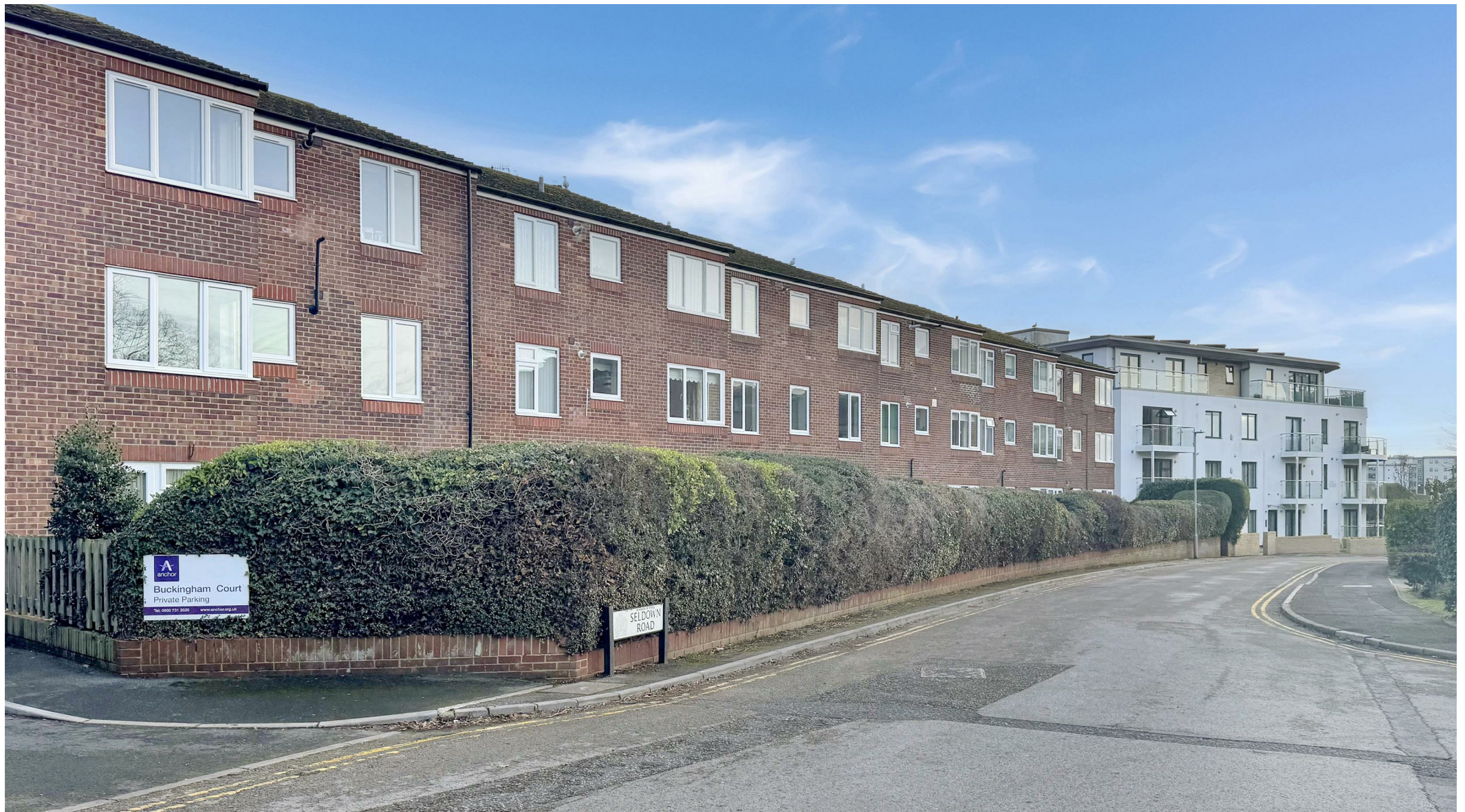
Buckingham Court 12 Mount Pleasant Road Poole BH15 1UQ £90,000