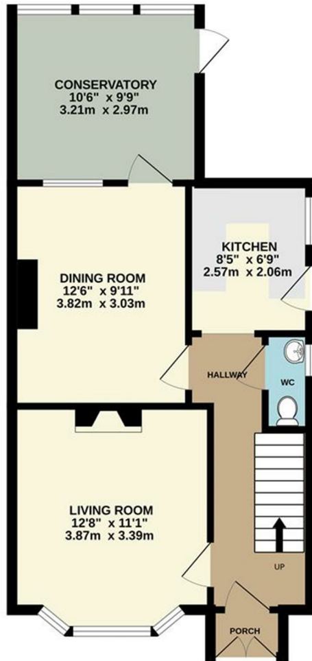
GROUND FLOOR 513 sq.ft. (47.6 sq.m.) approx.