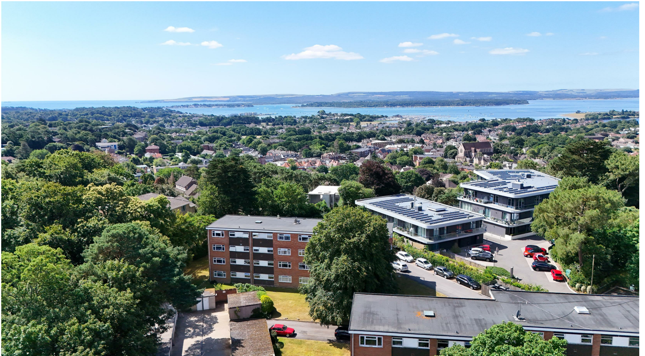
Purbeck Heights 9 Mount Road Poole BH14 0QP £210,000