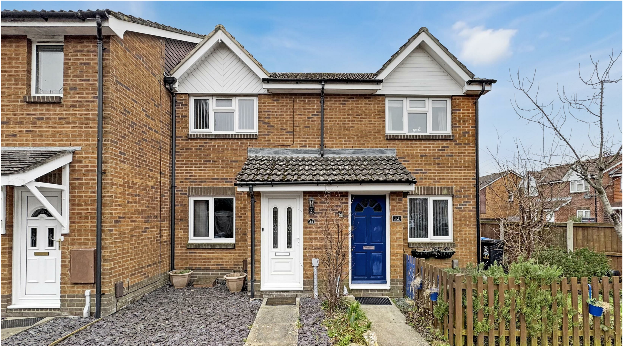
Bredy Close Poole BH17 9JP £239,950