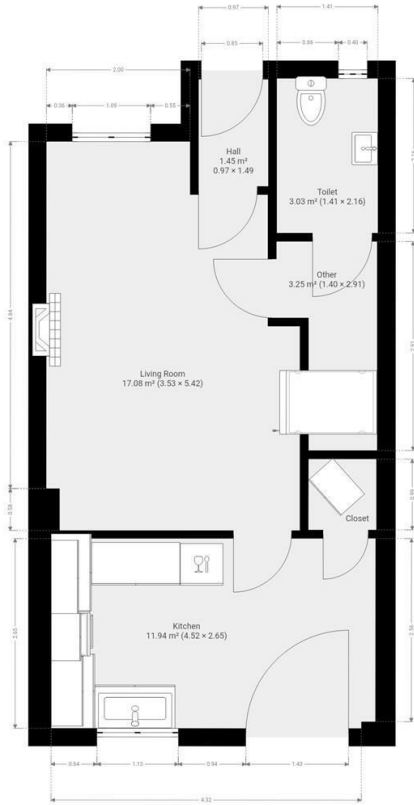
THIS FLOORPLAN IS PROVIDED WITHOUT WARRANTY OF ANY KIND. SENSOPIA DISCLAIMS ANY WARRANTY INCLUDING, WITHOUT LIMITATION, SATISFACTORY QUALITY OR ACCURACY OF DIMENSIONS.