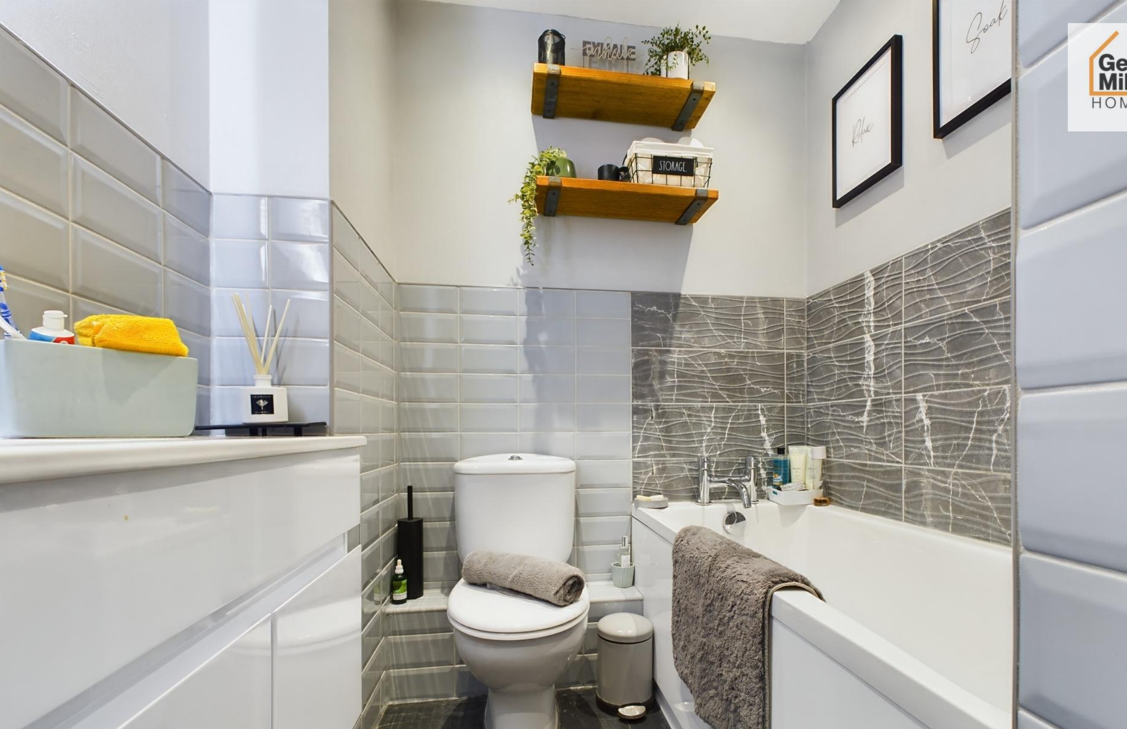
Apartment 7 Berkeley Court, Higher Green , Poulton-le-Fylde, Lancashire, FY6 7AW