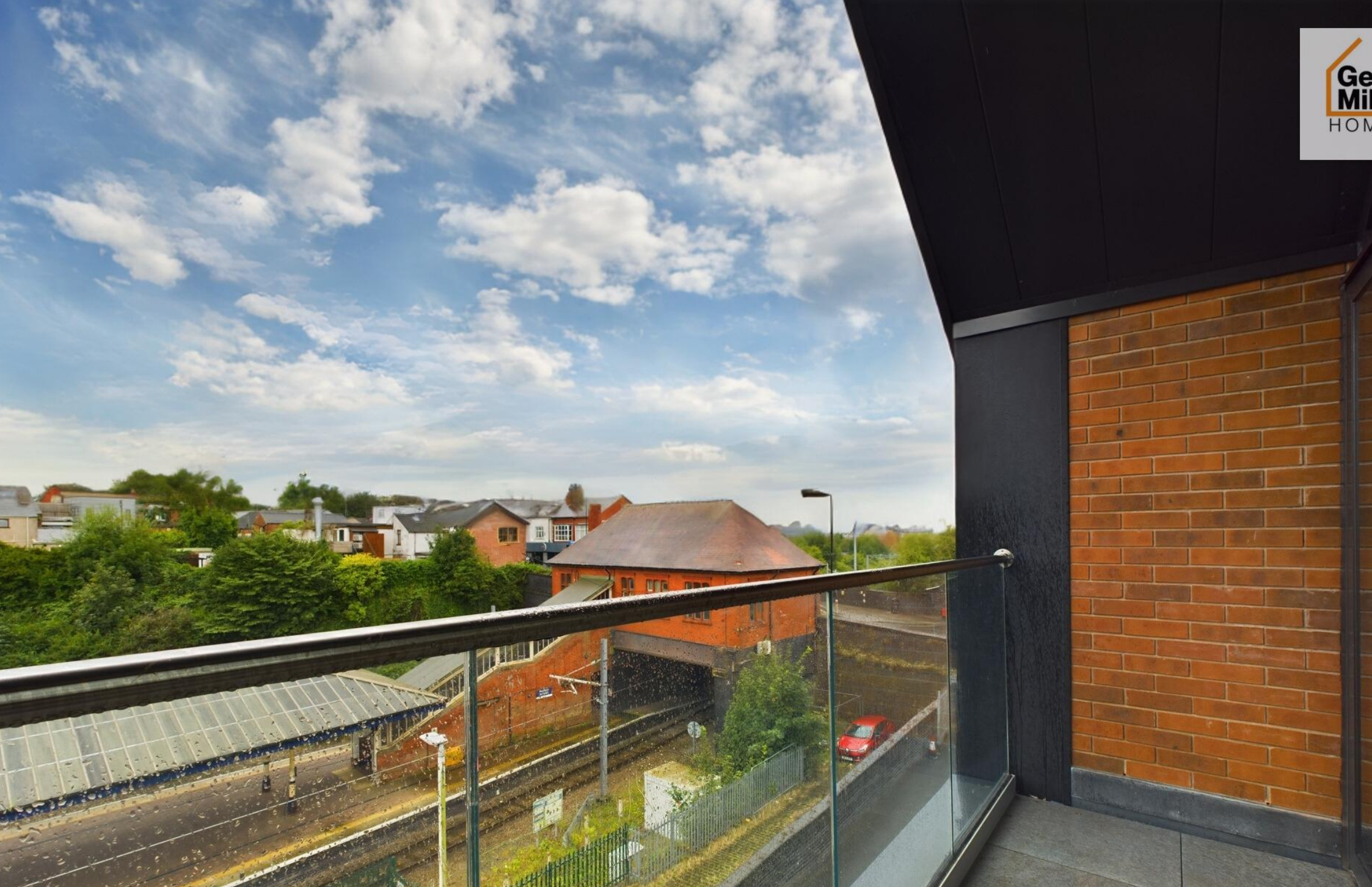
28E Breck Point , Breck Road , Poulton-le-Fylde , FY6 7AQ