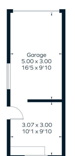
(Not Shown In Actual Location / Orientation)

Surveyed and drawn in accordance with the International Property Measurement Standards (IPMS 2: Residential)